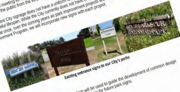
Existing entrance signs to our City's parks

The kick-off meeting for the Parks Sign Improvement Project was held on September 28th. Our goal was to engage the public from the very start. Our current City signage does not have a uniform look and some signs are beyond or reaching the limits of their useful lifespan. While the City currently does not have the funding to purchase new signs for all of our parks at once, over the coming years as park improvement projects are identified in our Capital Improvement Program, we will incorporate new signs with each project.