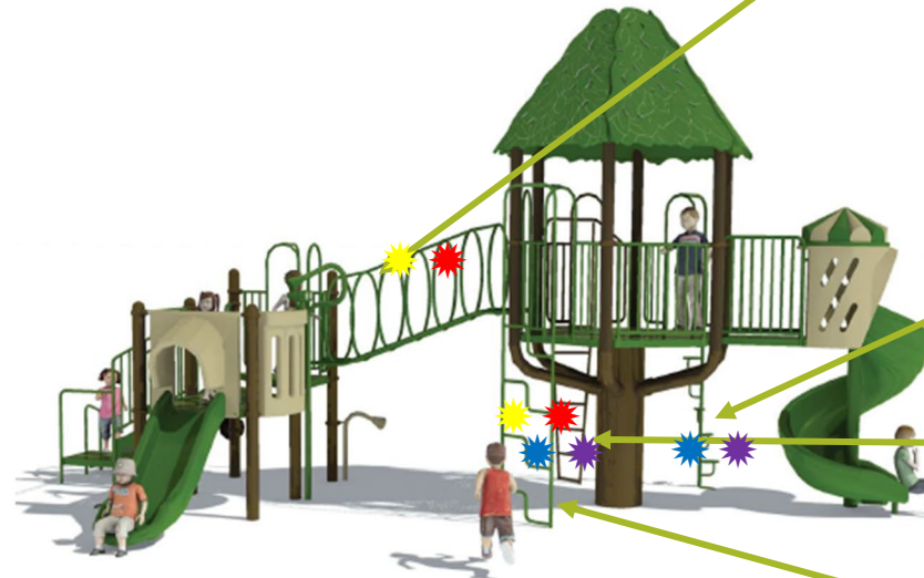
Existing Play Structure