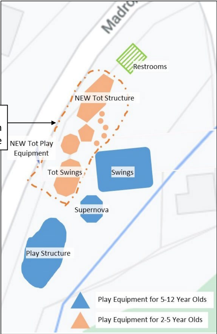
CURRENT PLAYGROUND LAYOUT

Existing climber removal proposed... ....to create space for new equipment in new tot play zone